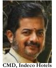
CMD, Indeco Hotels